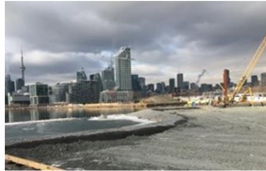
Toronto Waterfront, Don River Project Filling - MECP, Jan. 2019